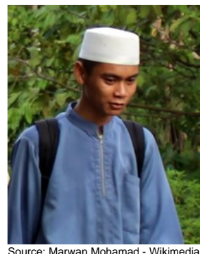
Population: 29,000 World Popl: 4,481,000