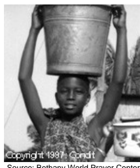
Copyright 1987: Condit Source: Bethany World Prayer Center

Population: 22,000 World Popl: 22,000 Total Countries: 1 People Cluster: Benue Main Language: Ejele Main Religion: Ethnic Religions Status: ● Partially reached Evangelicals: 3.0% Chr Adherents: 10.0% Scripture: Portions