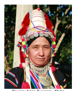
Population: 123,000 World Popl: 687,000 Total Countries: 5 People Cluster: Hani Main Language: Akha

Main Religion: Ethnic Religions Status: • Unreached