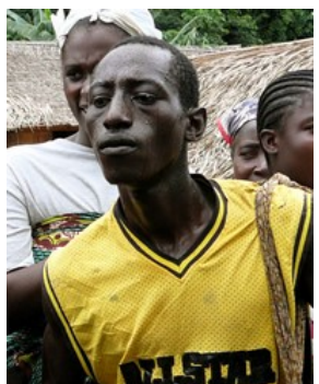
Population: 92,000 World Popl: 194,000 Total Countries: 2 People Cluster: Manding

Main Language: Manya Main Religion: Islam