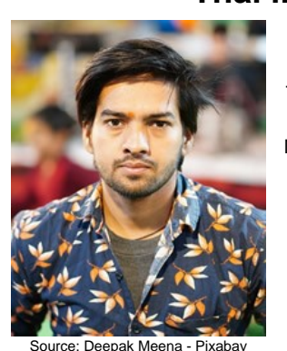
Population: 8,400 World Popl: 24,271,000 Total Countries: 29 People Cluster: Thai Main Language: Thai Main Religion: Buddhism Status: Unreached Evangelicals: 0.80% Chr Adherents: 3.00%