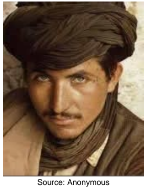
Population: 22,000 World Popl: 31,700

Total Countries: 2 People Cluster: South Asia Hindu - Yadav