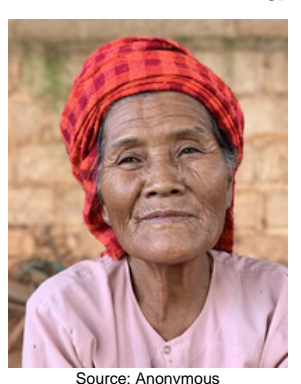
Population: 14,000 World Popl: 32,180,600 Total Countries: 18 People Cluster: Burmese Main Language: Burmese Main Religion: Buddhism Status: Unreached Evangelicals: Unknown %