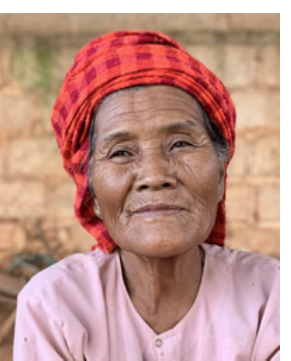
Population: 213,000 World Popl: 32,180,600 Total Countries: 18 People Cluster: Burmese Main Language: Burmese Main Religion: Buddhism Status: Unreached

Evangelicals: 0.42% Chr Adherents: 0.50%