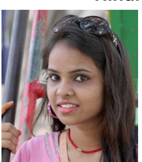
Population: 185,000 World Popl: 2,752,900