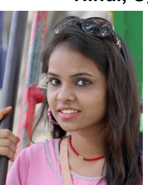
Population: 6,300 World Popl: 2,752,900 Total Countries: 17