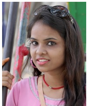
Population: 16,000 World Popl: 2,752,900 Total Countries: 17