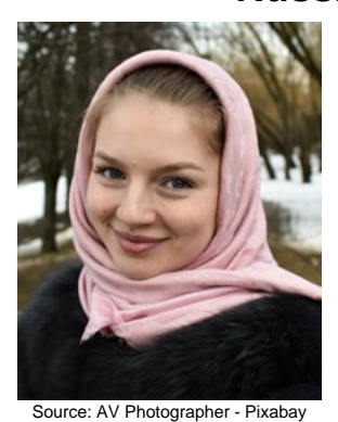
Population: 900 World Popl: 136,150,700