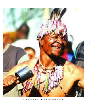
Population: 2,200 World Popl: 8,500 Total Countries: 5 People Cluster: Khoisan Main Language: Khwedam Main Religion: Ethnic Religions Status: Partially reached

Evangelicals: 5.0% Chr Adherents: 20.0% Scripture: Portions