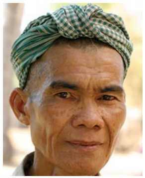
Population: 258,000 World Popl: 329,900 Total Countries: 7 People Cluster: Cham