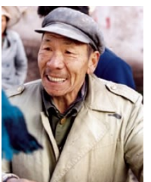
Population: 148,000 World Popl: 44,117,900 Total Countries: 18 People Cluster: Chinese

Main Language: Chinese, Min Nan Main Religion: Ethnic Religions Status: Unreached