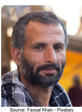
Population: 188,000 World Popl: 50,265,850 Total Countries: 216 People Cluster: Deaf