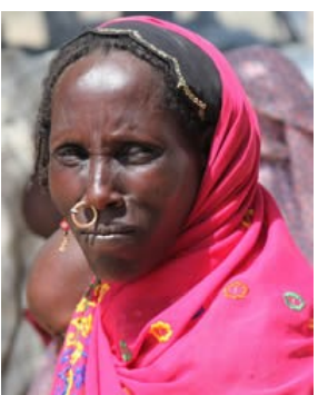
Population: 38,000 World Popl: 1,031,400 Total Countries: 3

People Cluster: Kanuri-Saharan Main Language: Kanembu Main Religion: Islam