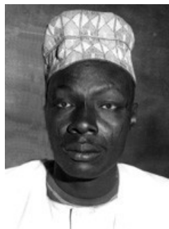
Copyright 1997: Condit Source: Bethany World Prayer Center

Population: 8,100 World Popl: 160,700 Total Countries: 3 People Cluster: Chadic Main Language: Buduma Main Religion: Islam Status: ● Unreached Evangelicals: 1.00% Chr Adherents: 1.00% Scripture: Portions