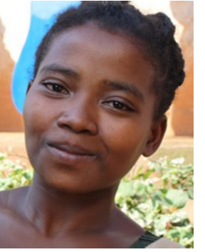
Total Countries: 1 People Cluster: Malagasy