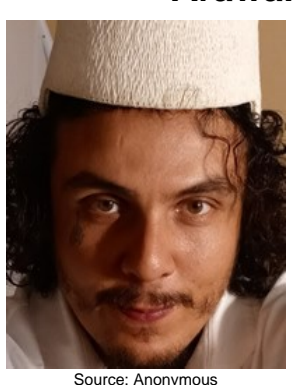
Population: 3,200 World Popl: 25,600 Total Countries: 5

People Cluster: South American Indigenous Main Language: Arawak