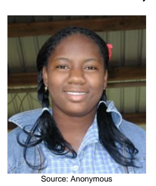
Population: 20,000 World Popl: 167,800