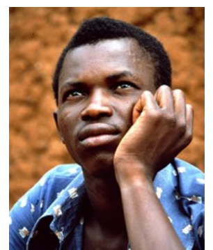
Population: 290,000 World Popl: 290,000

Total Countries: 1 People Cluster: Soninke