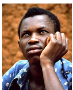
Population: 290,000 World Popl: 290,000 Total Countries: 1