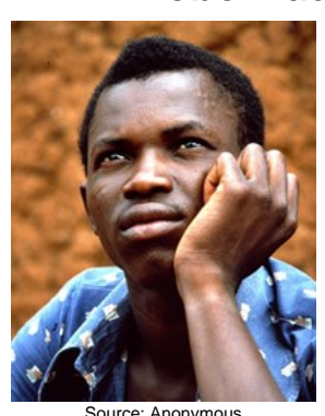
Population: 290,000 World Popl: 290,000

Total Countries: 1 People Cluster: Soninke