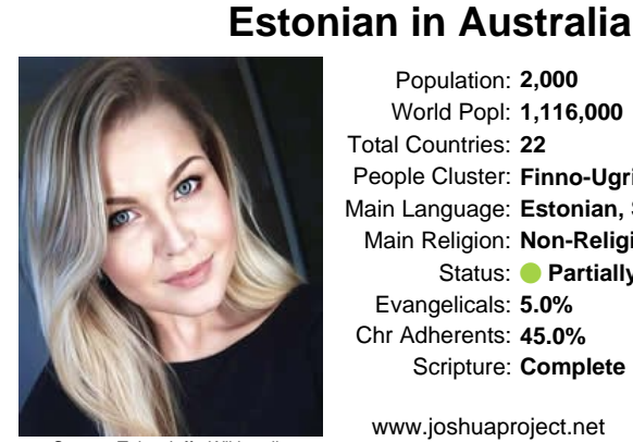
Population: 2,000 World Popl: 1,116,000 Total Countries: 22