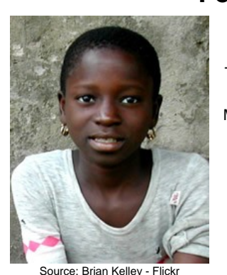
Population: 2,250,000 World Popl: 2,399,400 Total Countries: 6 People Cluster: Guinean Main Language: Fon