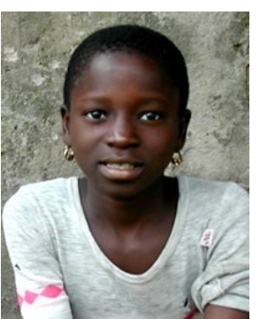
Total Countries: 6 People Cluster: Guinean Main Language: Fon