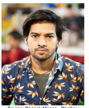
Population: 152,000 World Popl: 24,271,000 Total Countries: 29 People Cluster: Thai Main Language: Thai Main Religion: Buddhism Status: Unreached Evangelicals: 0.30% Chr Adherents: 0.60%