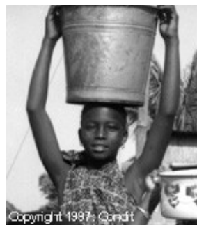
Copyright 1987: Condit Source: Bethany World Prayer Center

Population: 22,000 World Popl: 22,000 Total Countries: 1 People Cluster: Benue Main Language: Ejuele Main Religion: Ethnic Religions Status: ● Partially reached Evangelicals: 3.0% Chr Adherents: 10.0% Scripture: Portions