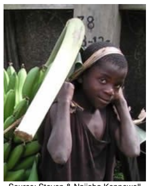
Population: 396,000 World Popl: 1,677,000