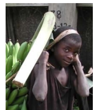
Population: 396,000 World Popl: 1,677,000