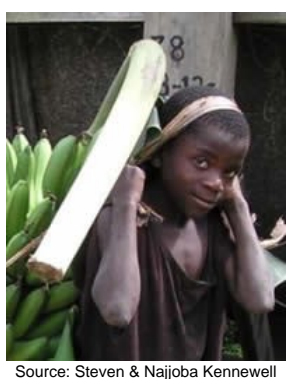
Population: 396,000 World Popl: 1,677,000