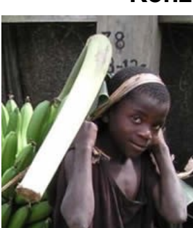
Population: 396,000 World Popl: 1,677,000