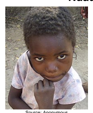
Population: 1,175,000 World Popl: 1,206,000