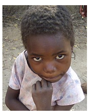
Population: 1,175,000 World Popl: 1,206,000