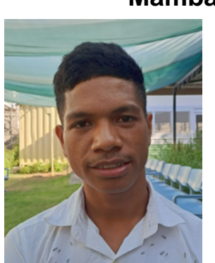
Population: 161,000 World Popl: 161,000 Total Countries: 1 People Cluster: Timor Main Language: Mambae Main Religion: Christianity

Status: Partially reached Evangelicals: 2.3%