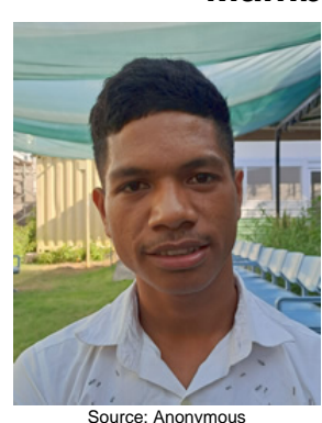
Population: 161,000 World Popl: 161,000 Total Countries: 1 People Cluster: Timor Main Language: Mambae Main Religion: Christianity