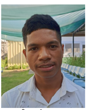
Population: 161,000 World Popl: 161,000 Total Countries: 1 People Cluster: Timor Main Language: Mambae Main Religion: Christianity

Status: Partially reached Evangelicals: 2.3%