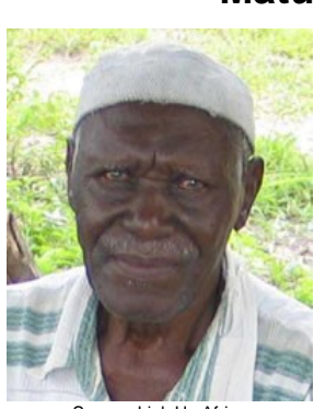
Population: 313,000 World Popl: 313,000