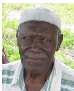
Population: 313,000 World Popl: 313,000