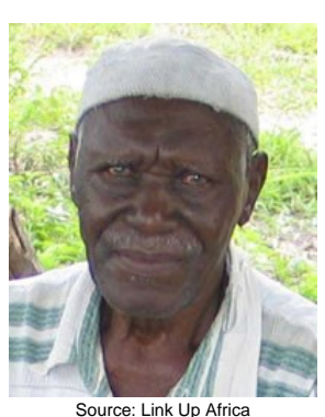
Population: 313,000 World Popl: 313,000 Total Countries: 1