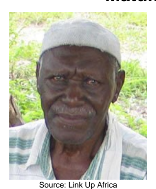
Population: 313,000 World Popl: 313,000 Total Countries: 1