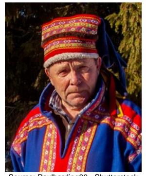
Population: 33,000 World Popl: 42,800 Total Countries: 3

People Cluster: Finno-Ugric, Saami Main Language: Saami, North Main Religion: Christianity