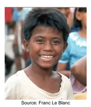
Total Countries: 1 People Cluster: Maluku-Central