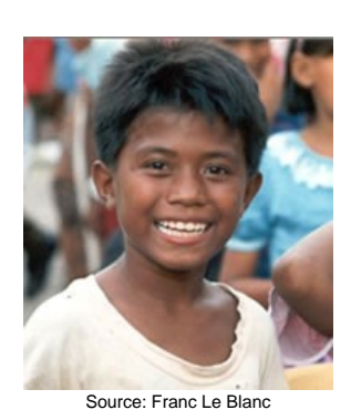
World Popl: 3,500 Total Countries: 1 People Cluster: Maluku-Central