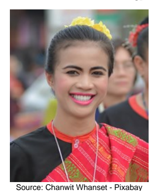
Population: 255,000 World Popl: 1,054,000 Total Countries: 4 People Cluster: Tai Main Language: Phu Thai Main Religion: Buddhism