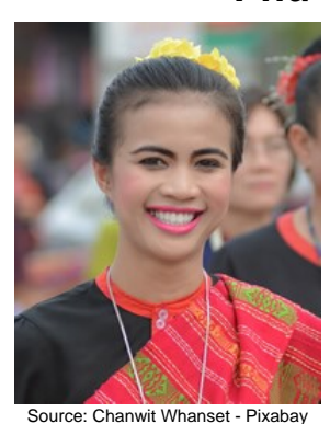
Population: 255,000 World Popl: 1,054,000 Total Countries: 4 People Cluster: Tai Main Language: Phu Thai Main Religion: Buddhism