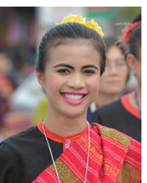
Population: 255,000 World Popl: 1,054,000 Total Countries: 4 People Cluster: Tai Main Language: Phu Thai Main Religion: Buddhism