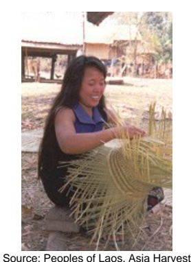
Population: 29,000 World Popl: 29,000 Total Countries: 1

People Cluster: Mon-Khmer Main Language: Phong-Kniang Main Religion: Ethnic Religions Status: * Frontier Unreached