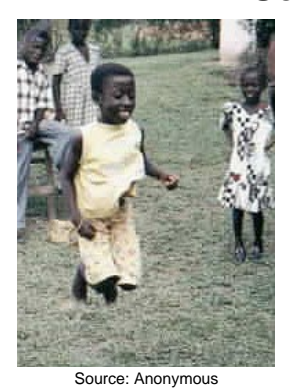
Population: 441,000 World Popl: 461,000 Total Countries: 2

People Cluster: Guinean Main Language: Esahie Main Religion: Christianity