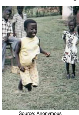
Population: 441,000 World Popl: 461,000 Total Countries: 2

People Cluster: Guinean Main Language: Esahie Main Religion: Christianity