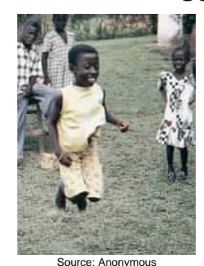
Population: 441,000 World Popl: 461,000 Total Countries: 2 People Cluster: Guinean Main Language: Esahie Main Religion: Christianity