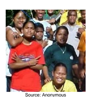
World Popl: 1,600 Total Countries: 2 People Cluster: Micronesian