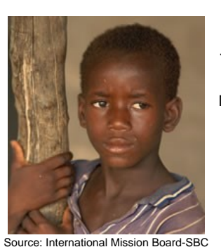
Population: 6,600 World Popl: 1,922,600 Total Countries: 2 People Cluster: Gur