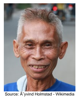
Population: 7,600 World Popl: 24,488,900