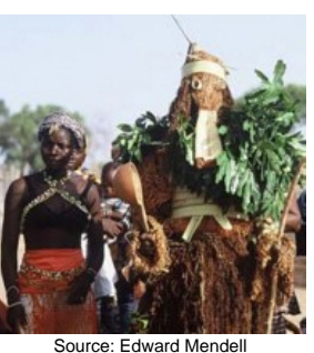
Total Countries: 2 People Cluster: Atlantic Main Language: Wamey Main Religion: Ethnic Religions