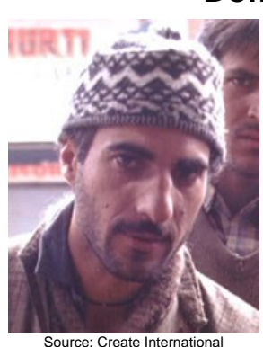
Population: 8,700 World Popl: 23,700