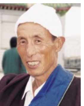
Status: * Frontier Unreached Evangelicals: 0.00% Chr Adherents: 0.00%