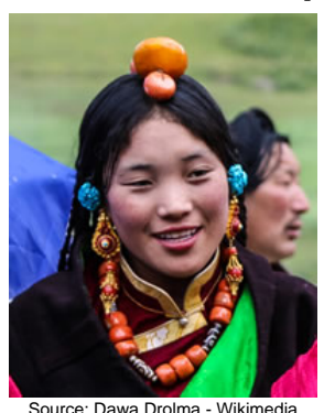
Population: 1,000 World Popl: 1,599,700 Total Countries: 3 People Cluster: Tibetan Main Language: Khamba

Main Religion: Buddhism Status: Unreached Evangelicals: Unknown % Chr Adherents: 0.90%