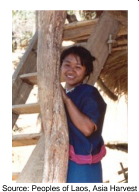
Population: 39,000 World Popl: 44,100 Total Countries: 2