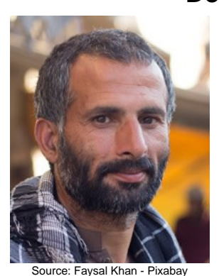
Population: 800 World Popl: 50,265,850 Total Countries: 216 People Cluster: Deaf