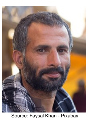
Population: 800 World Popl: 50,265,850 Total Countries: 216 People Cluster: Deaf